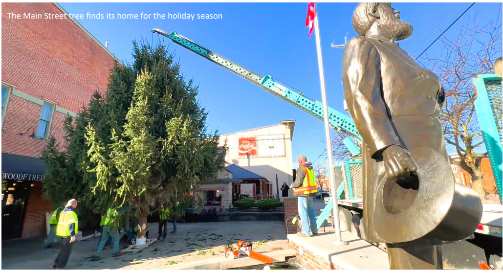
The Main Street tree finds its home for the holiday season